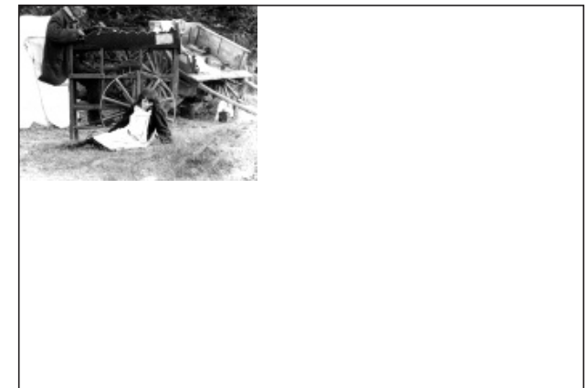
Knife Grinder, c.1890