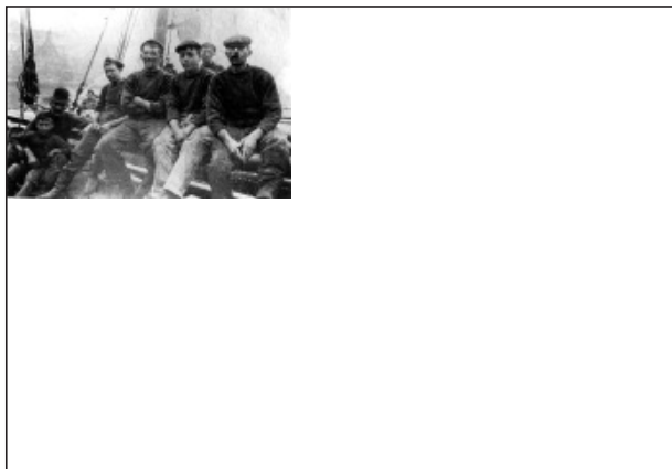
Newlyn Fishermen, c.1900