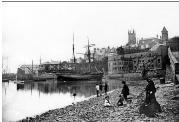
The Harbour, Penzance, 1870s