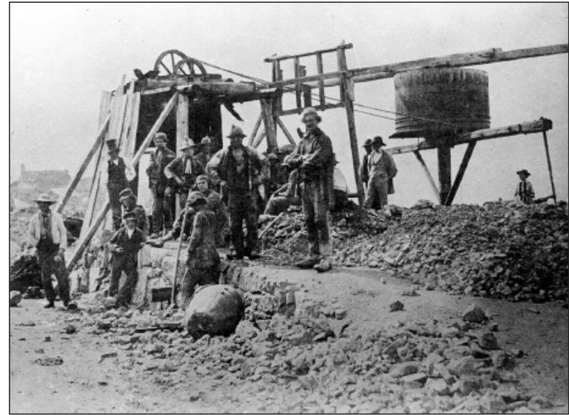
Mining in the 1850s